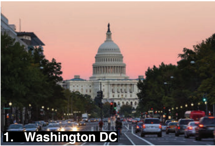
1. Washington DC