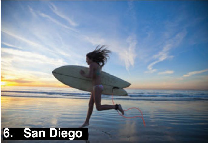
6. San Diego