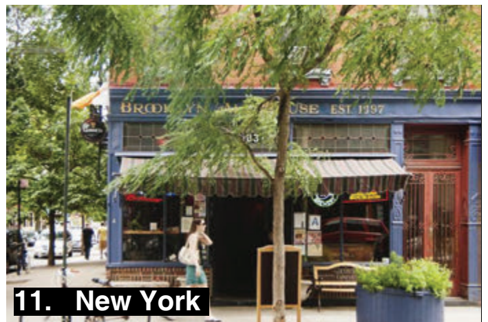
11. New York