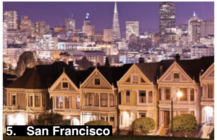
5. San Francisco